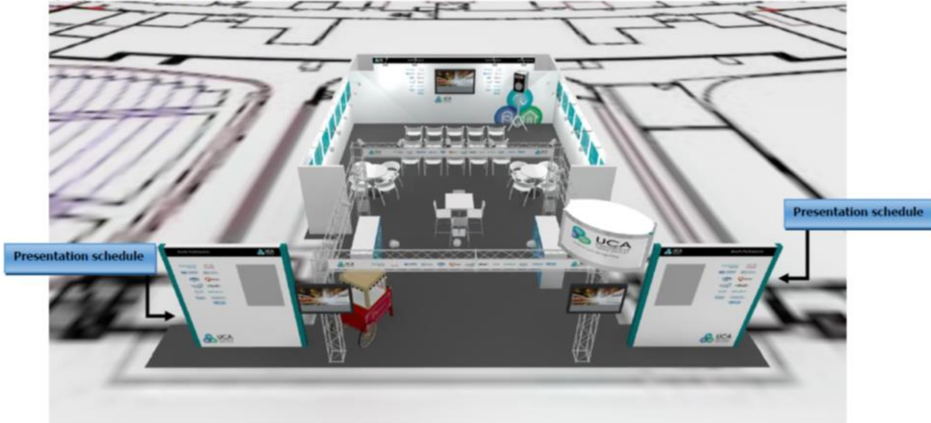
3) Impressions Square Room